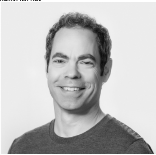
Representative Group: Community

Short Biography : Put up my hand a few years ago at the original Tungsten Fabric meeting for the governance committee to help shepherd this project into the open source community. Background in evolutionary genetics, I grew up on the internet and I have spent 20+ years in the tech industry, with a focus on application networking - I was lucky to be exposed to open source software and cloud computing very early after their inception. In addition to running multiple small tech companies, I serve on multiple boards including Genome Canada and Air Transat.